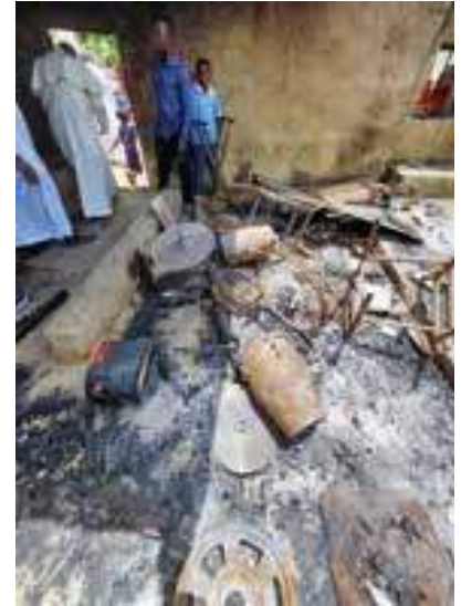
Destroyed church building in Kaduna.

example, dozens of Christians were killed in towns and villages in Nigeria's Middle Belt. Terrorists had already massacred over 300 Christians in this region during the Christmas period in 2023.