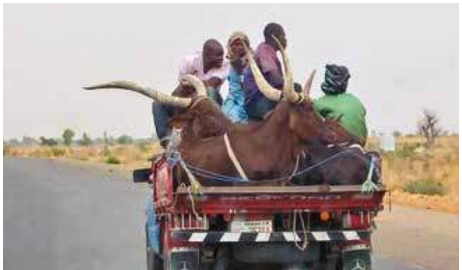
On the road from Maiduguri to Jos.

The problems in Nigeria are complex. A rapidly growing population, the effects of climate change and the struggle for the country's resources are compounded by the interests of extremist groups like Boko Haram and the Fulani. Around Easter, for