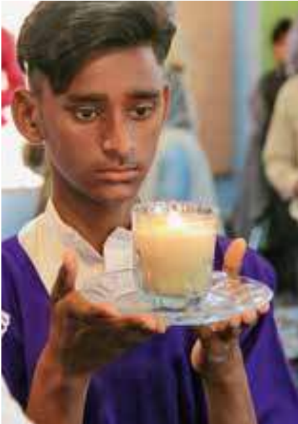
During a Mass in the Parish of St Luke, Baldia Town, near Karachi.

intense pressure from both the state and Islamist extremist groups. The majority of ordinary people also believe that only Muslims are fully-fledged Pakistani citizens. In this challenging situation, it is crucial to advocate for oppressed Christians in the country and to protect them as much as possible from discrimination and violence. ACN stands by the Church in Pakistan in this endeavour.